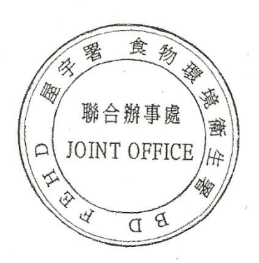
Joint Office of Buildings Department and Food and Environmental Hygiene Department